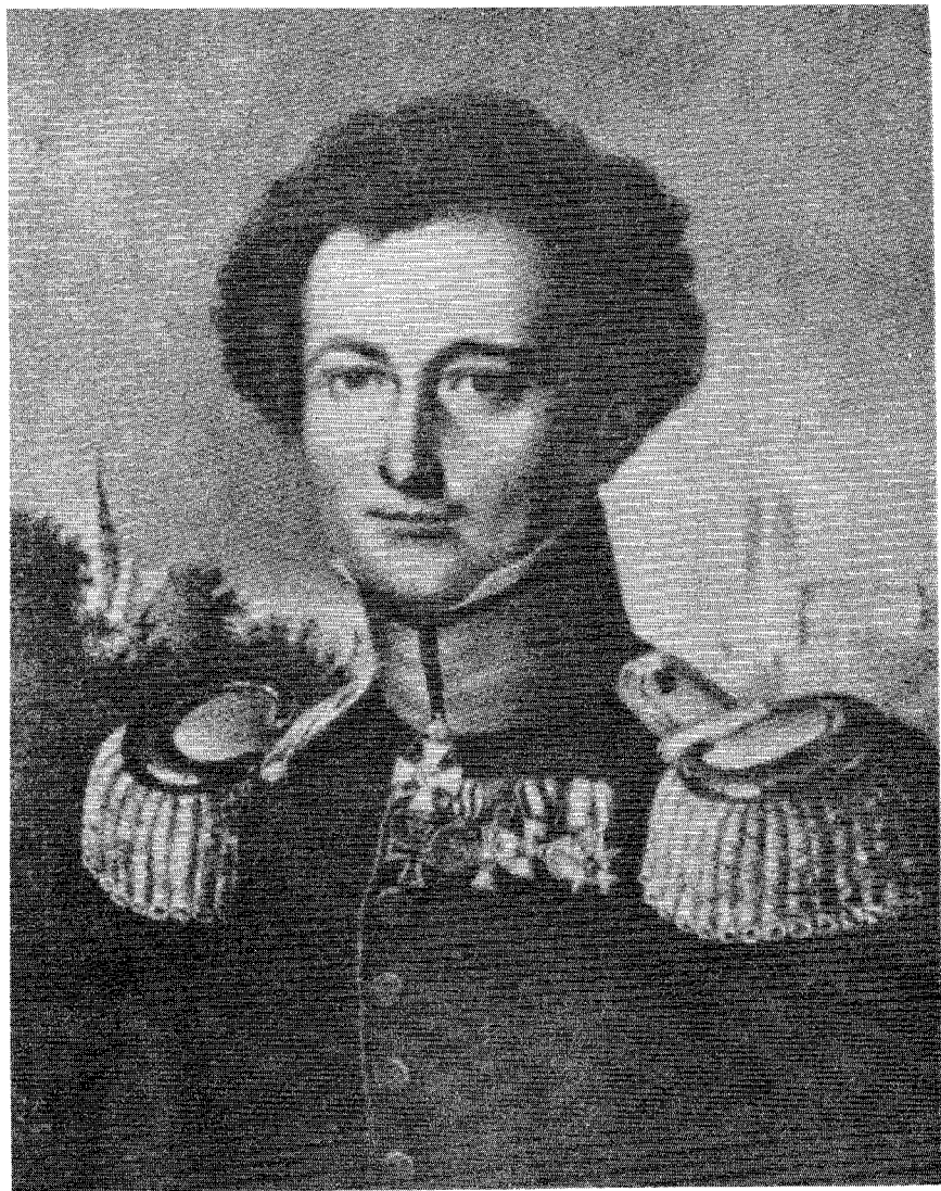
CARL VON CLAUSEWITZ